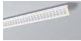
Z8 H 65 mm W 30 mm