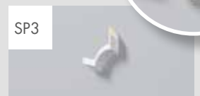
SP3-3 H 23 mm W 13 mm