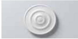
R10 Ø 600 mm T 52 mm