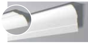
AD22 H 100 mm W 225 mm