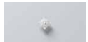
R13 W 100 mm D 100 mm T 20 mm