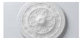
R25 Ø 965 mm T 80 mm