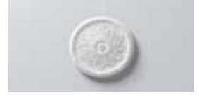
R9 Ø 530 mm T 40 mm