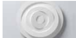
CR11 Ø 1100 mm T 120 mm