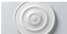
R20 Ø 755 mm T 55 mm