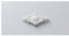
R1 Ø 605 mm D 310 mm T 38 mm