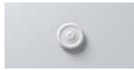
R4 Ø 300 mm T 30 mm