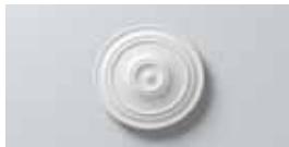
R15 Ø 560 mm T 60 mm