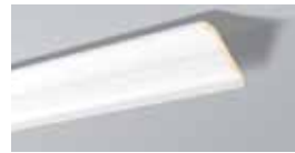
Z21 H 100 mm W 115 mm