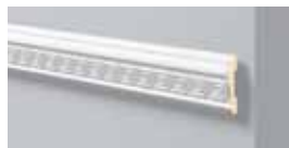
Z31+flex H 80 mm W 20 mm