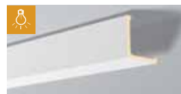
L1 H 150 mm W 150 mm