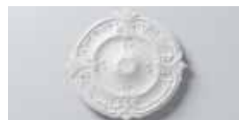
R24 Ø 770 mm T 35 mm