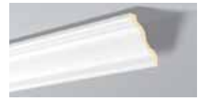
Z22 H 125 mm W 105 mm