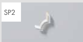
SP2-4 H 21 mm W 10 mm