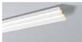
Z52 H 75 mm W 75 mm