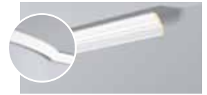
Z18+flex H 60 mm W 50 mm