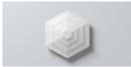
R51 Ø 590 mm T 46 mm