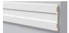
Z60 H 210 mm W 20 mm