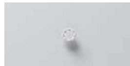
R17 Ø 80 mm T 12 mm