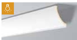
L3 H 175 mm W 145 mm