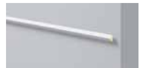
SP3 H 23 mm W 13 mm