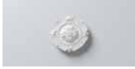
R6 Ø 400 mm T 50 mm