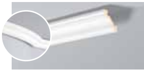
Z19+flex H 80 mm W 80 mm