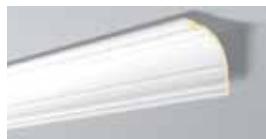
Z40 H 175 mm W 170 mm