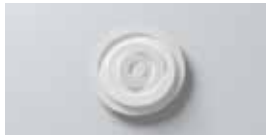
CR5 Ø 550 mm T 60 mm