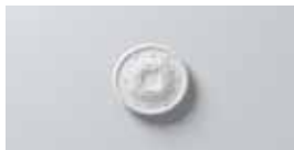
R1520 Ø 400 mm T 32 mm