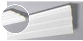
AD21 H 255 mm W 60 mm