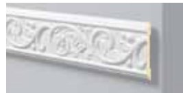
Z12 H 125 mm W 15 mm