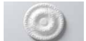
R18 Ø 600 mm T 65 mm