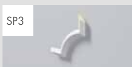
SP3-4 H 23 mm W 13 mm