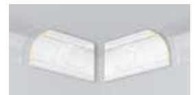
Z42 H 175 mm W 170 mm