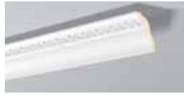
Z3 H 105 mm W 75 mm