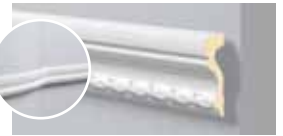
Z1+flex H 105 mm W 40 mm