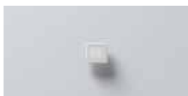
R30 W 100 mm D 100 mm T 30 mm