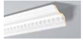
Z5 H 125 mm W 125 mm