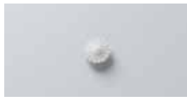
R3 Ø 155 mm T 35 mm