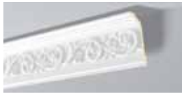
Z11 H 150 mm W 70 mm