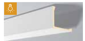
L2 H 200 mm W 250 mm