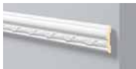
Z30+flex H 80 mm W 20 mm