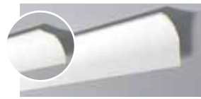
AD23 H 100 mm W 225 mm