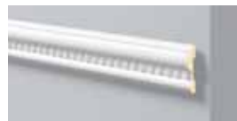
Z32+flex H 80 mm W 20 mm