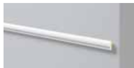
SP1 H 28 mm W 10 mm