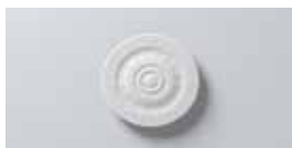
R23 Ø 515 mm T 35 mm