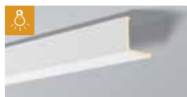
L4 H 100 mm W 100 mm