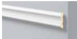
Z1550 H 80 mm W 20 mm