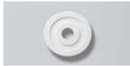
R60 Ø 560 mm T 20 mm