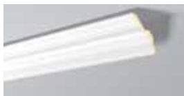
Z24 H 125 mm W 125 mm