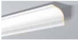
Z6 H 120 mm W 125 mm