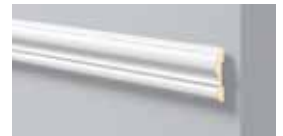
Z13+flex H 80 mm W 20 mm