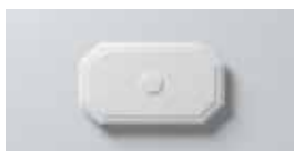
R52 W 640 mm D 445 mm T 40 mm