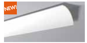
AD24 H 150 mm W 150 mm