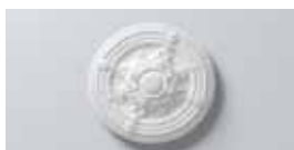
R11 Ø 660 mm T 70 mm