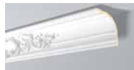
Z41 H 175 mm W 170 mm