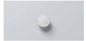
R1410 Ø 160 mm T 16 mm