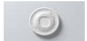
R1517 Ø 300 mm T 34 mm