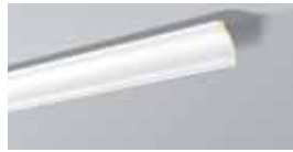
Z1220 H 75 mm W 50 mm