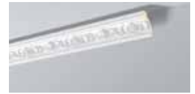
Z9 H 70 mm W 35 mm