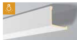
L5 H 200 mm W 200 mm