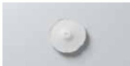
R16 Ø 480 mm T 40 mm