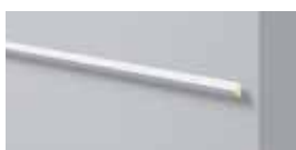
SP3 H 23 mm W 13 mm