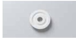
R61 Ø 420 mm T 15 mm