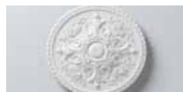
R12 Ø 825 mm T 48 mm