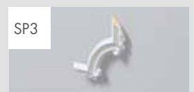
SP3-7 H 23 mm W 13 mm