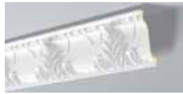
Z7 H 220 mm W 100 mm