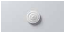
R14 Ø 340 mm T 50 mm