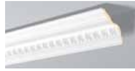
Z4 H 125 mm W 125 mm