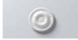
R8 Ø 495 mm T 55 mm