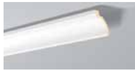
Z20 H 90 mm W 85 mm