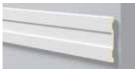
Z61 H 157,5 mm W 15 mm