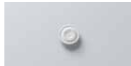
R1516 Ø 200 mm T 32 mm