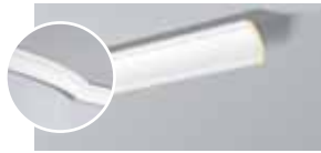
Z16+flex H 70 mm W 50 mm