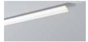
Z1250 H 35 mm W 35 mm