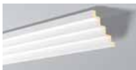
Z51 H 150 mm W 150 mm