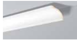
Z17 H 80 mm W 115 mm