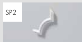
SP2-5 H 21 mm W 10 mm