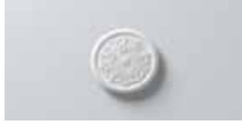
R7 Ø 435 mm T 45 mm