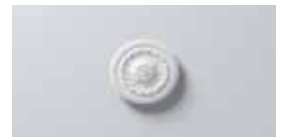
R5 Ø 400 mm T 53 mm