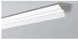
Z2 H 85 mm W 85 mm