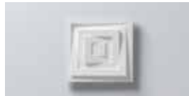
CS5 W 550 mm D 550 mm T 60 mm