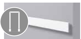
WD2 kit H 70 mm W 15 mm