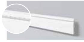
FO2 H 120 mm W 15 mm