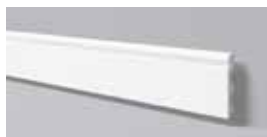
FL4 H 150 mm W 20 mm