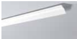
WT26 H 75 mm W 75 mm