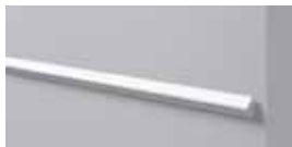
WL1 H 40 mm W 20 mm