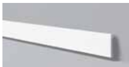
FD2 H 110 mm W 15 mm