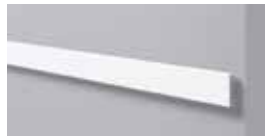
WD2 H 70 mm W 15 mm