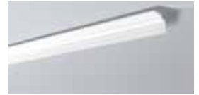
WT25 H 80 mm W 80 mm