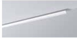
WT8 H 30 mm W 20 mm