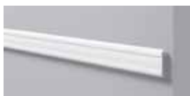
WL5 H 85 mm W 15 mm