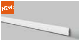
FB1 H 60 mm W 13 mm