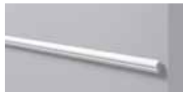
WL2 H 40 mm W 20 mm