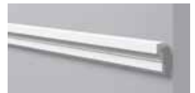
WL4 H 100 mm W 40 mm