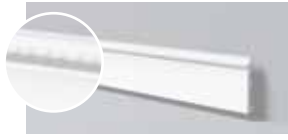
FO1 H 120 mm W 15 mm