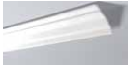
WT24 H 150 mm W 150 mm