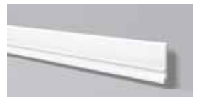
FD21 H 130 mm W 20 mm