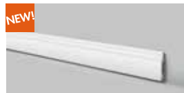
FB2 H 100 mm W 13 mm