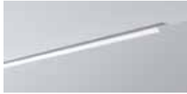
WT7 H 16 mm W 22 mm