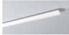
WT9 H 50 mm W 40 mm