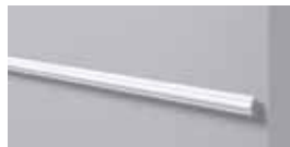
WL3 H 40 mm W 15 mm