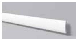
FD3 H 100 mm W 20 mm