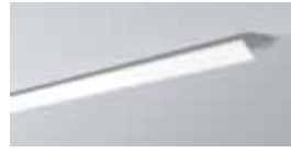
WT1 H 45 mm W 60 mm