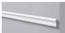
WL6 H 75 mm W 20 mm