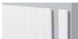
WG1 H 10 mm W 79 mm