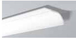
WT22 H 100 mm W 225 mm