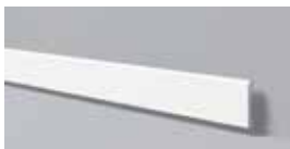
FD1 H 100 mm W 15 mm