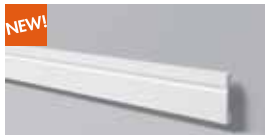
FD11 H 110 mm W 18 mm