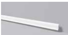
FL3 H 55 mm W 17 mm