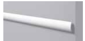
WD3 H 70 mm W 15 mm