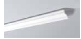
WT10 H 80 mm W 80 mm