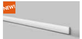
FT2 H 58 mm W 13 mm