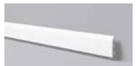
FL5 H 100 mm W 20 mm