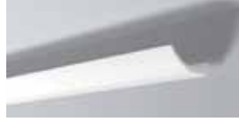
WT4 H 70 mm W 180 mm