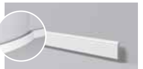
FL1 +flex H 80 mm W 12 mm