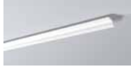
WT5 H 50 mm W 50 mm