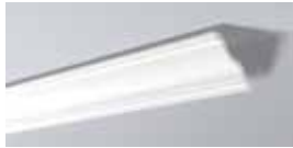
WT11 H 130 mm W 105 mm